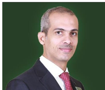
CHAIRMAN & INDEPENDENT NON-EXECUTIVE DIRECTOR (KUWAITI)